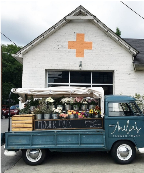
AMELIA'S FLOWER TRUCK