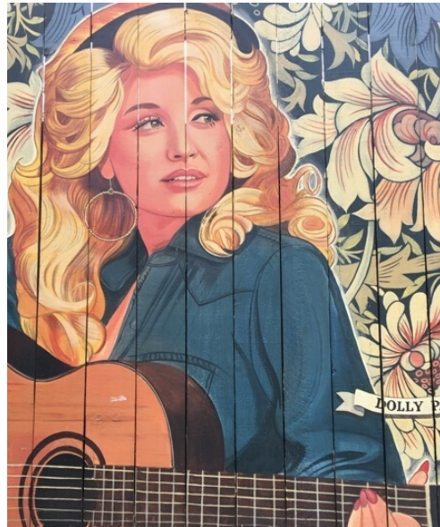
DOLLY PARTON MURAL