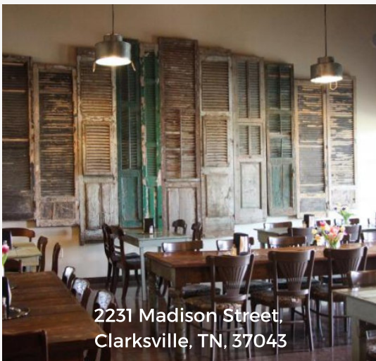
2231 Madison Street, Clarksville, TN, 37043