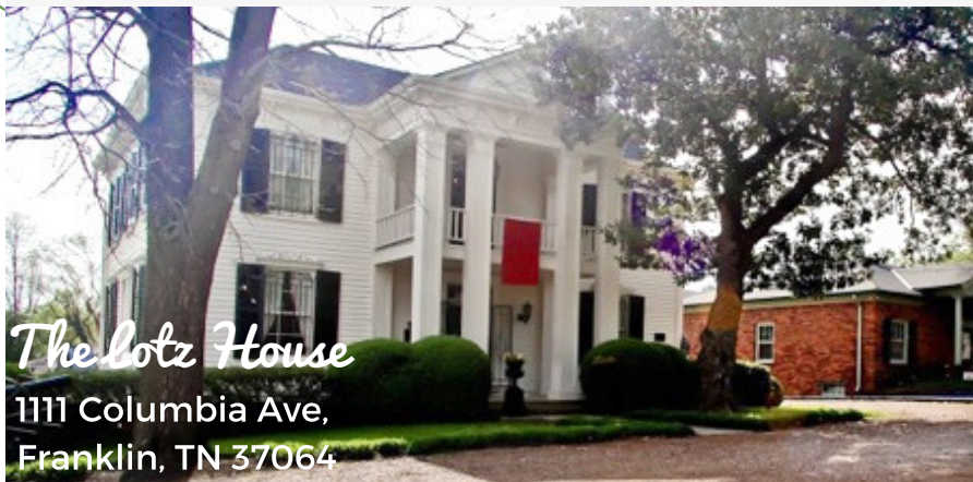
The Lotz House 1111 Columbia Ave, Franklin, TN 37064

East Park 700 Woodland Street Nashville, TN 37206